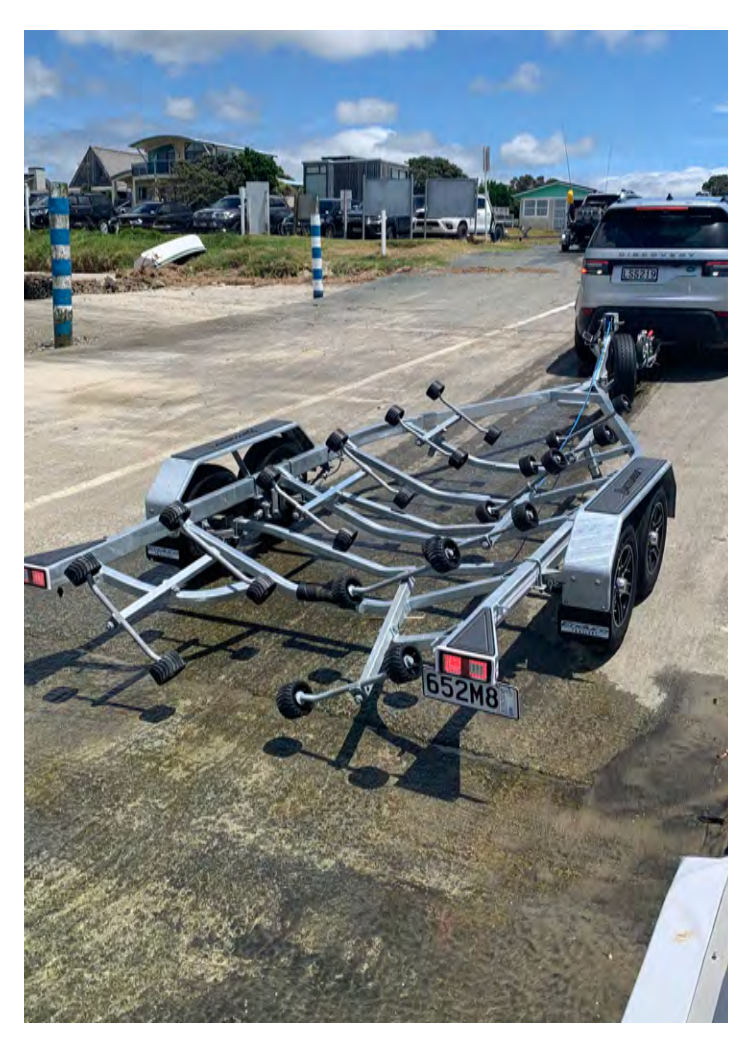
The Enduro multi-roller trailer is braked using an override system.