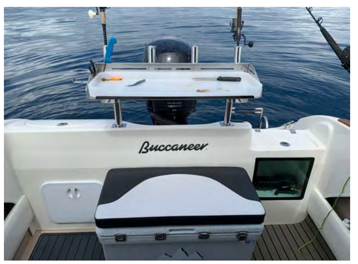
The transom is dominated by the large bait board/rigging station.

incorporating cup holders on the port side, with well-positioned handrails located where they are most likely to be needed. The dash has been 'borrowed' from the Billfisher and Eldorado ranges and provides plenty of real estate for a 12" screen – in this case a Raymarine plotter/sounder - along with a double row of switches, Mercury analogue engine gauges, trim buttons, phone charger plugs, the Maxwell RC 6 capstan control and rode counter, plus G Com VHF and GME stereo units. A small shelf sits at the bottom, perfect for vehicle keys, cellphones, and the