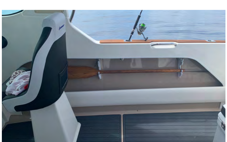
Full-length cockpit side shelves are fitted with holders for rods, gaffs, paddles and the like.

Billfisher. The 22-degree deadrise made short work of any chop, but the counter to that is the hull is less stable at rest. Trimming the boat at speed is affected by any crew changing position, and in the afternoon when the wind got up it showed the typical hardtop/