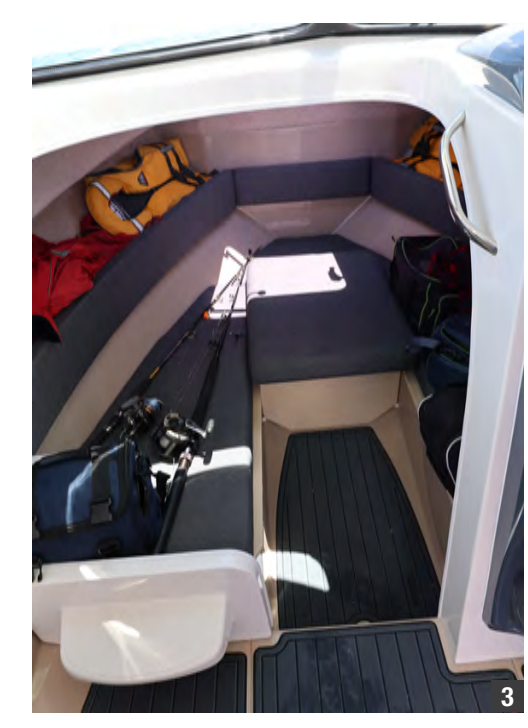
1) Buccaneer's bespoke rod holders. 2) Pedestal seat bases have minimal intrusion into the cockpit space. 3) There is plenty of room to overnight on the full-length bunks.

gunwale covering boards, and a further three (Buccaneer-style) on either side of the hardtop. These are angled, making them ideal when seeking a bit of extra spread when trolling multiple lines for