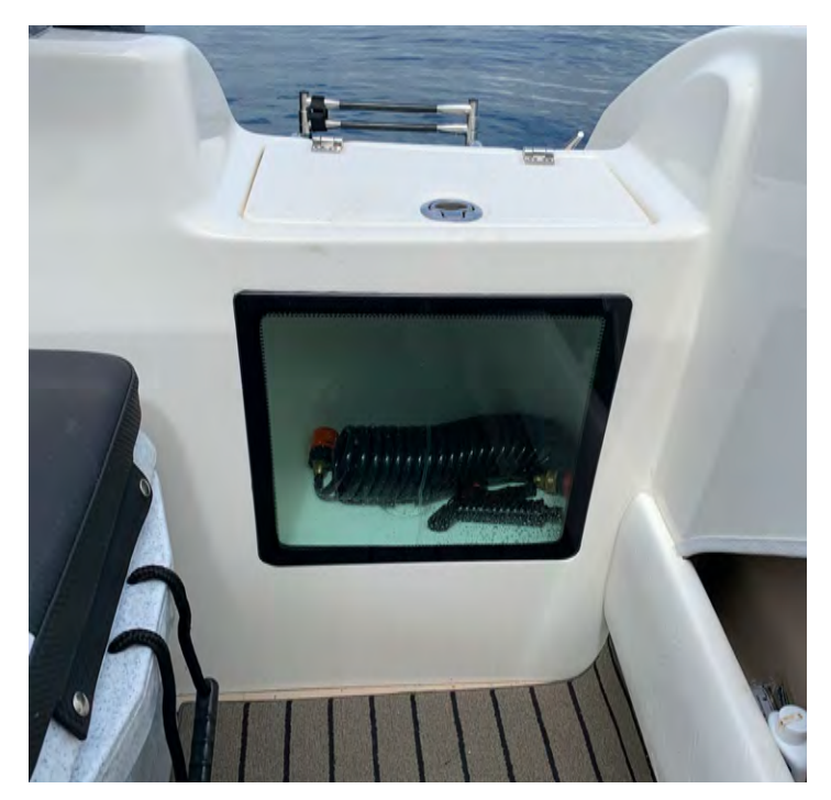
The livebait tank aerator and the washdown hose run off the same pump.

facing light bar attached to the hardtop.