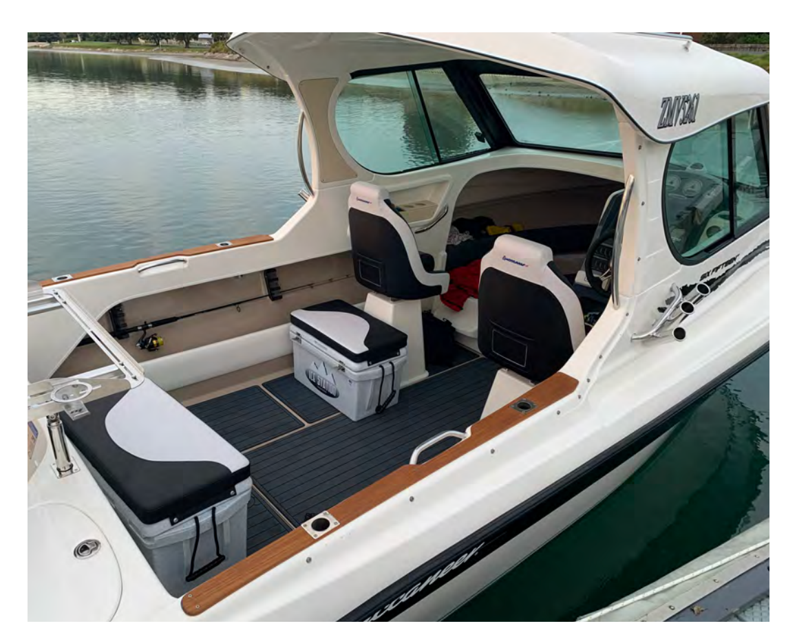
The cockpit layout featuring Sea-Dek underfoot.

compared to alloy construction. Any imperfections show in the finished component, so a lot of time goes into the process initially."