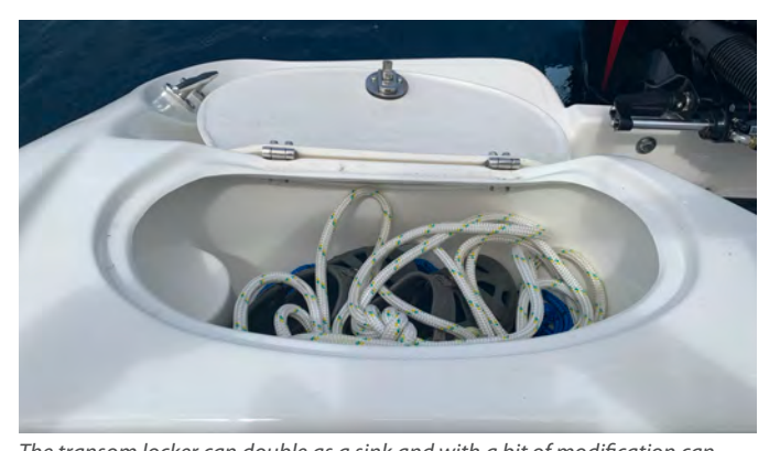
The transom locker can double as a sink and with a bit of modification can house two tuna tubes.