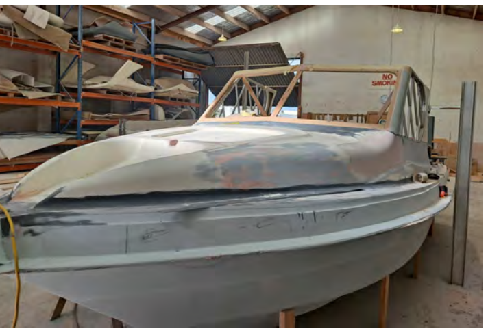
To make sure they had the lines right, a mockup of the hardtop was made before production began.