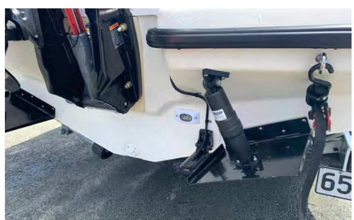
Trim tab bases are recessed into the transom.