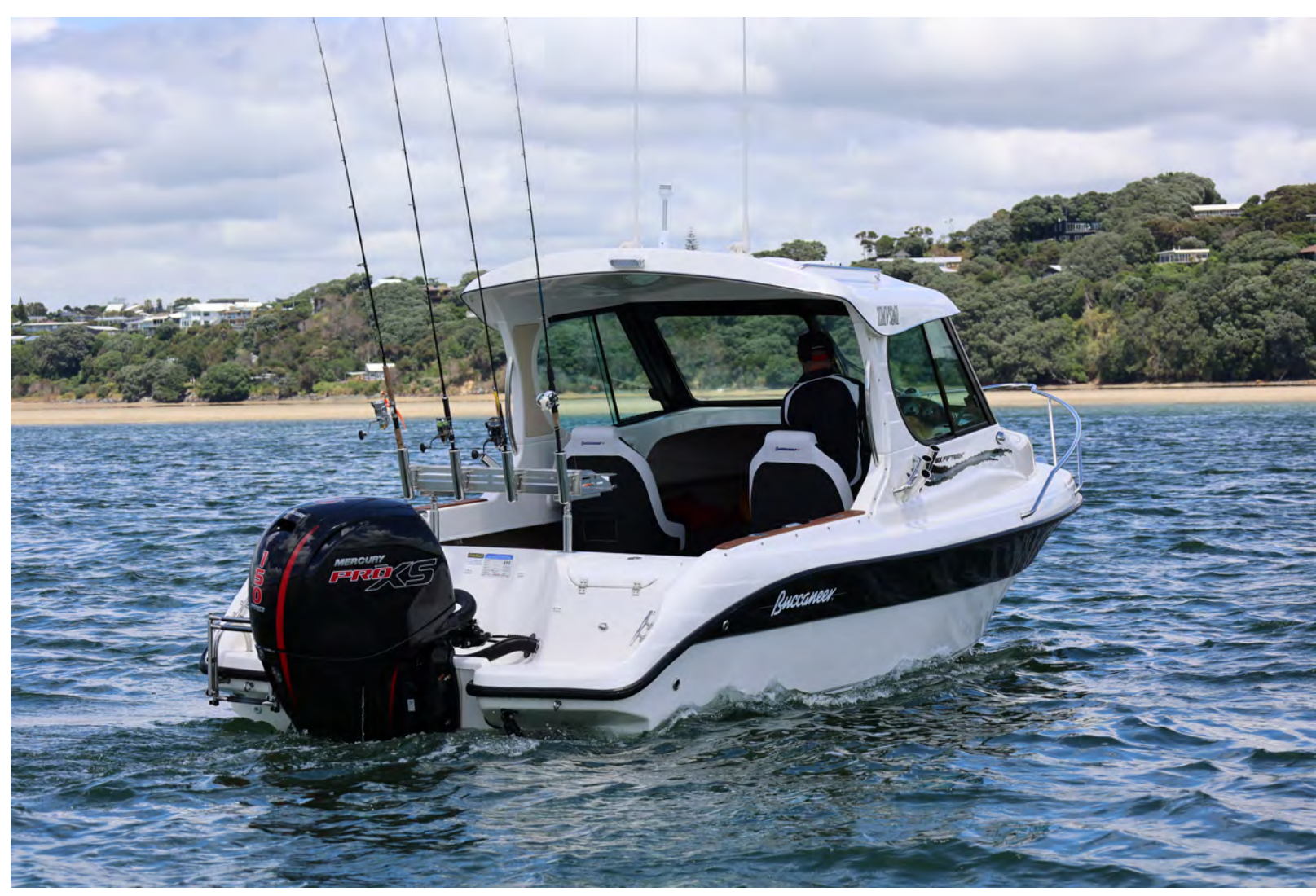
The effort that has gone into producing the Six Fifteen's hardtop shows in the finished product.