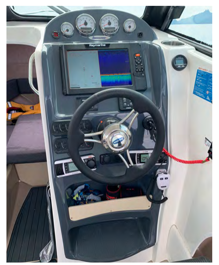
The dash has been 'borrowed' from the Eldorado and Billfisher models.