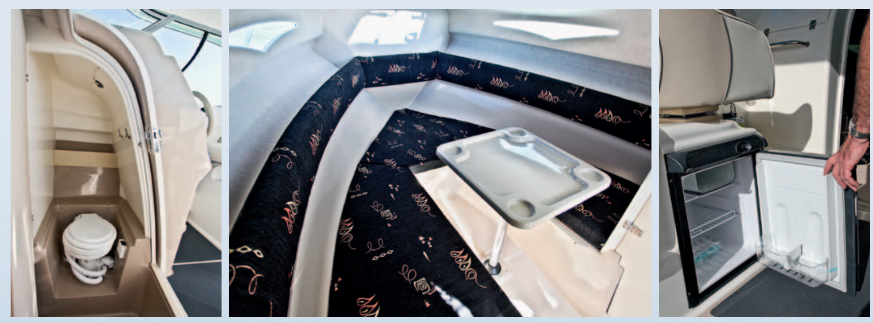
The Sportsman 735 retains plenty of family comforts, including an electric toilet in its own cubicle, removable cabin table and a small fridge

serious proposition for bluewater fishing with a healthy dollop of ease thrown into the equation.