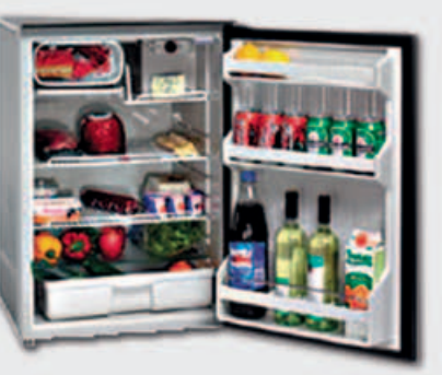
CR130 FRIDGE SPECIAL DEAL $1195 inc GST - while stock lasts (applies to standard icebox model only).

PH 09 415 1456 FAX 09 415 1457 Email info@fridgetech.co.nz Web www.fridgetech.co.nz