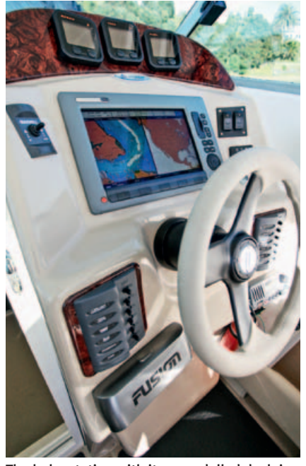
The helm station with its remodelled dash is ergonomically superb

But it's the fishing makeover that stands out. While the Exess is unashamedly a high-end family cruiser which fishers treat nervously (you do NOT want fish guts on that upholstery), the Sportsman is sympathetic to the angler.